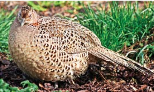
Males (top) have iridescent green-blue head and neck, a dapper white neck ring, bright red featherless patch around eyes, and a long brown and reddish brown-speckled tail. Females (above) are drab brown all over, with no white ring around neck.

The roots of the current program date back to the