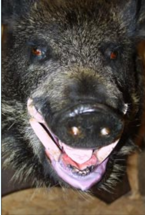
The taxidermist’s skill is tested by delicate work around his subjects’ mouths, ears, nose and eyes. This wild sports a freshly painted mouth.

And then there’s the smells of a taxidermist studio. No, it’s not the smell of