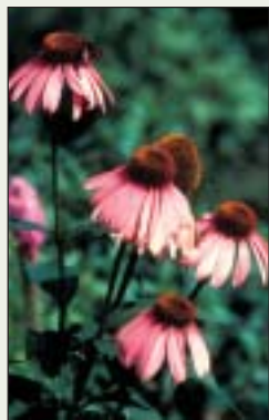
Butterflies and bees feed on the nectar of purple coneflowers; goldfinches love their seeds.

By choosing native plants, you avoid spreading invasive plants such as autumn olive, Japanese barberry and oriental bittersweet. Although these plants have wildlife value, they crowd out the region's distinct natural vegetation. Using native eastern plants can also improve your gardening success, as they tend to flourish in our conditions, without fertilizers and pesticides.