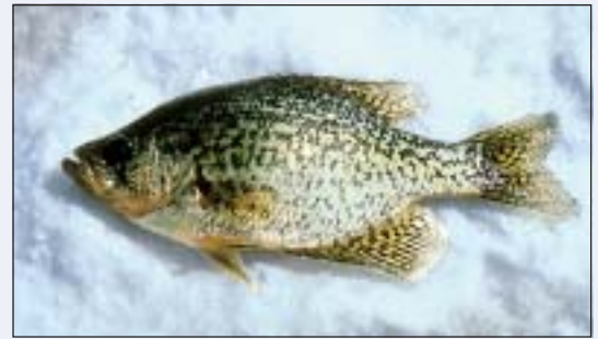
What can a kid catch through the ice? Pickerel, perch, bass and the ever-popular crappie.

Is the ice safe? Well, the honest answer is that no ice is ever safe, but here are a few guidelines: Solid, clear ice of 5 to 6 inches is adequate for small groups; ice thickness of 8 inches and up is good for large groups. Be aware that ice can be weakened by objects frozen into the ice, because they hold the heat from the sun; avoid docks, large rocks and trees fallen onto the ice. Always check the ice before you go out. Use the spud to thump the ice as hard as you can; if the spud does not break through, continue onto the ice. Make a test hole to check the thickness where the spud hit, and check the ice at intervals on your way out to your